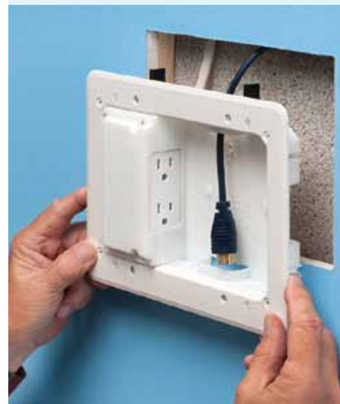
Recessed Electrical TV Box, Pg. 57

Home Theater Cables & Adapters, Tools, Cable Management, Batteries, Flashlights and Z-Wave Wireless Automation