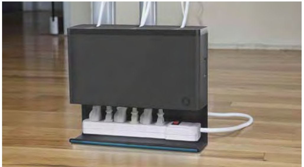
Quirky Plug Hub, Pg. 15