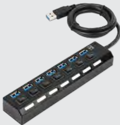
7-Port USB 3.0 Hub, Pg. 42