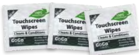
Screen Cleaning Wipes, Pg. 69