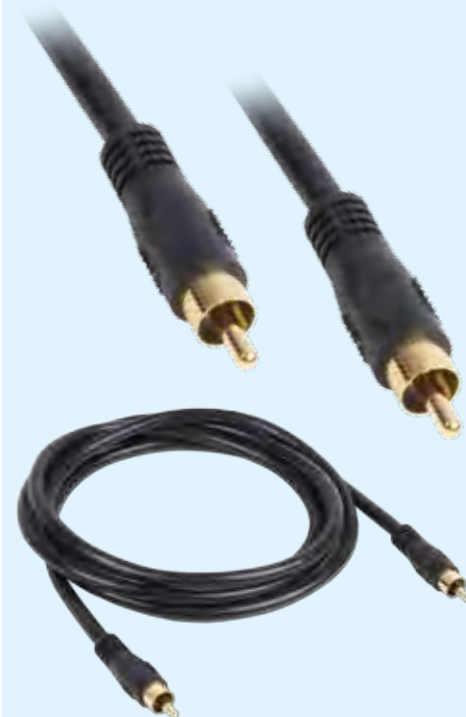
75Ω Composite Video Cables, Pg. 55