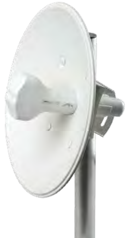
NanoBridge Wi-Fi Router/Antenna, Pg. 18

Outdoor Wireless Networks, Open Mesh Networks, Routers & Modems, Network Cables & Hardware, Tools And Rackmounts