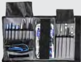
iFixit Tool Kit, Pg. 51

Keyboards, Mice, Connectors & Adapters, A/V Input, Usb Cables & Hubs, Video Cables & Adapters, Internal Hardware & Tools