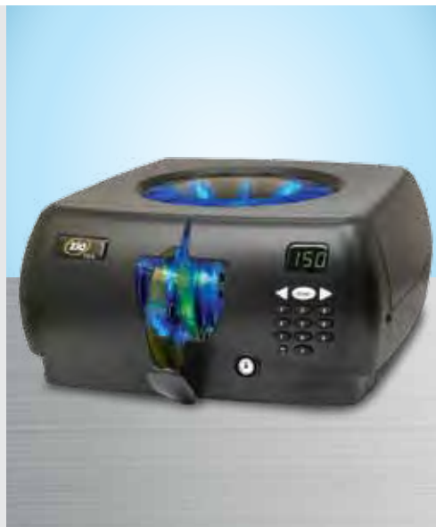
150 Disc Media Carousel Plus, Pg. 79