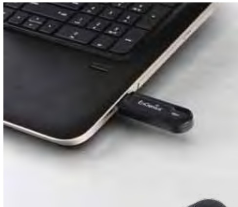
Dual-Band Wi-Fi Adapter, Pg. 25