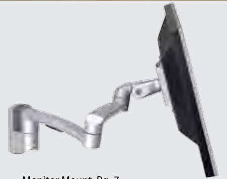
Monitor Mount, Pg. 7

Mobile Workstations, CPU Mounts, Risers & Stands, Cord Management, Surge Protectors & Cleaning Supplies