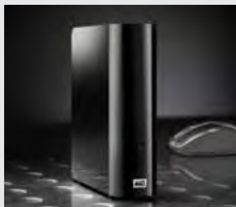
3TB USB 3.0 External Drive, Pg. 76

Hard Drives, Wireless Hard Drives, Thumb Drives, Flash Memory Cards, Carrying Cases, Media Carousels and Disc Storage