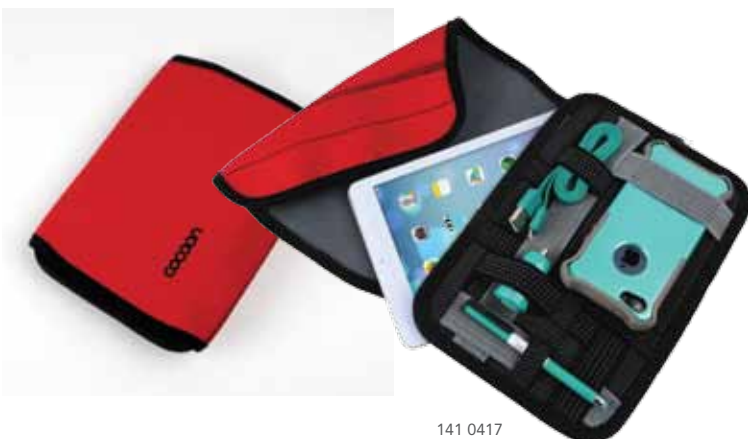
141 0417 GRID-IT! 7 tablet case $24.99

Protect your tablet and organize your accessories with the Grid-IT Wrap neoprene sleeve. Available in two sizes, it includes an array of elastic straps that are perfect for gadget retention. The fabric can stretch to accommodate bulkier items like chargers. You can even slide your phone into the straps.