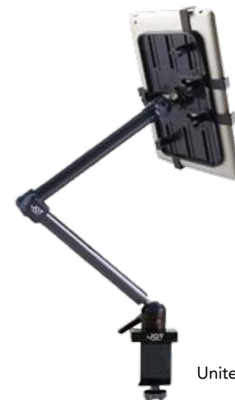
Unite C-Clamp Mount $89.95