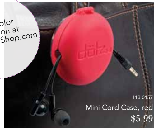
113 0157 Mini Cord Case, red $5.99

Full color selection at MobileLifeShop.com