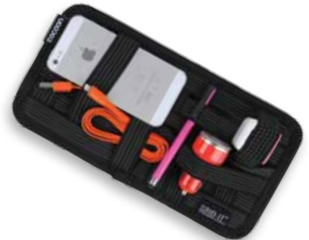
141 0111 GRID-IT! Organizer Medium $14.99