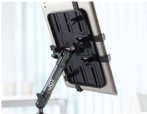
Unite Desk Stand $89.95