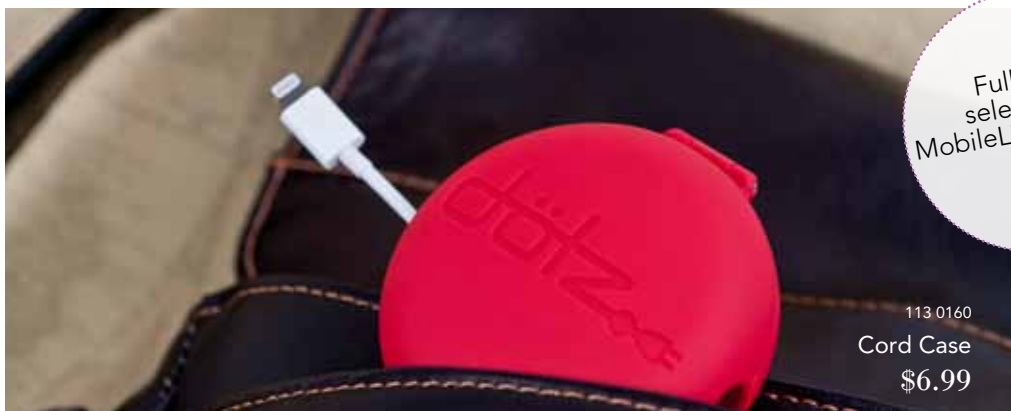
113 0160 Cord Case $6.99

The smaller Dotz mini cord wrap works for cords of 5 feet or less and includes a detachable clip so you can quickly attach it to a bag, case, strap or pocket.