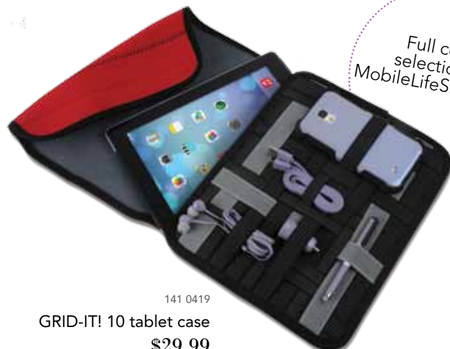
141 0419 GRID-IT! 10 tablet case $29.99

Full color selection at MobileLifeShop.com