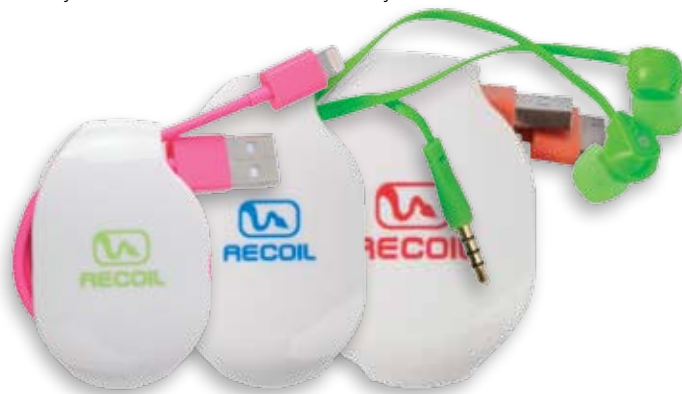
113 0037 Large Recoil winder $8.99

The age of tangled messy headphone and charger cables is over: use a Recoil cord winder to tuck nearly any loose cord into a durable egg-shaped housing. Just feed a little of your cable into the mechanism and it rolls the rest right out of sight. Both ends stick out of the Recoil winder so you can only have to extend as much cord as you need.