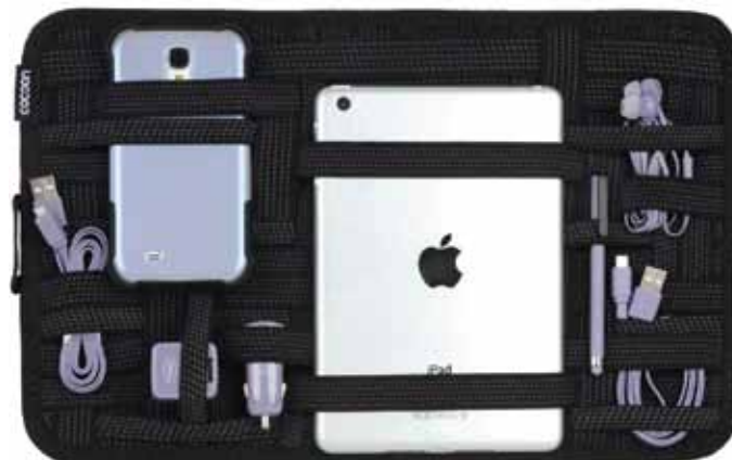
141 0115 GRID-IT! Organizer Large $24.99