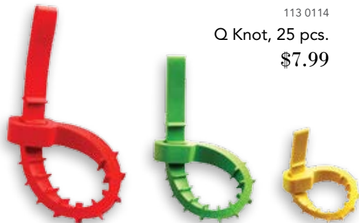
113 0114 Q Knot, 25 pcs. $7.99

A Q Knot is a big rubbery reusable zip tie that's useful for bundling just about anything. Control cord bundles, organize art supplies, cinch bags sealed or keep loose objects organized. Q Knots are stronger than twist ties but completely reusable. In their bright assorted colors, they look pretty slick too.