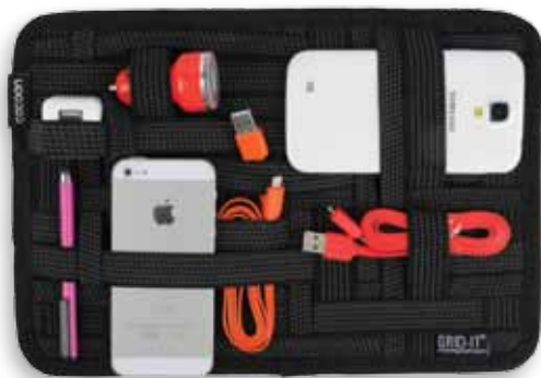
141 0113 GRID-IT! Organizer Medium $19.99